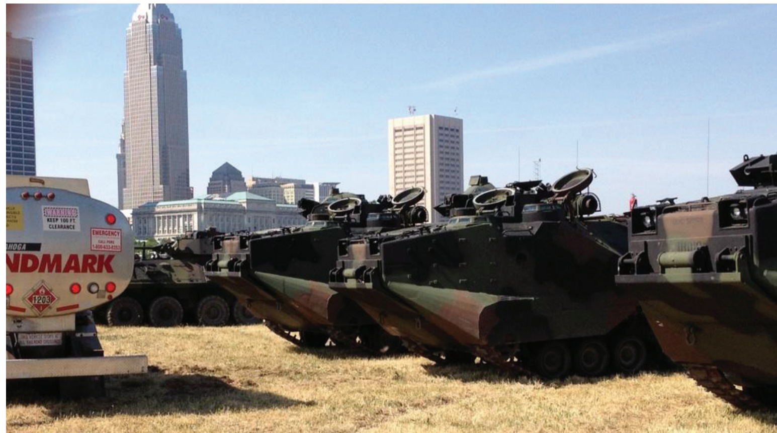
Landmark Fueling US Military Vehicles

In addition, our fueling service has been extremely effective in keeping emergency utility crews working during emergency outages.